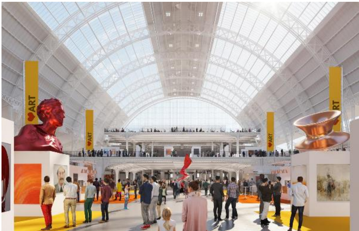
Olympia London Renovation

July 2018 - The inaugural West Kensington Design District is set to be the must-visit destination of London Design Festival 2018 with an exciting line-up including the newly opened Japan House, Design Museum, V&A Blythe House, 100% Design and more.