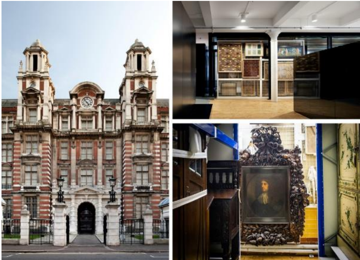
V&A Blythe House