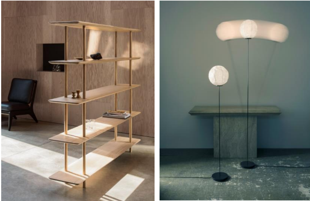
L-R Benchmark, Established & Sons

New roster includes Benchmark, Established & Sons and Dare Studio among others