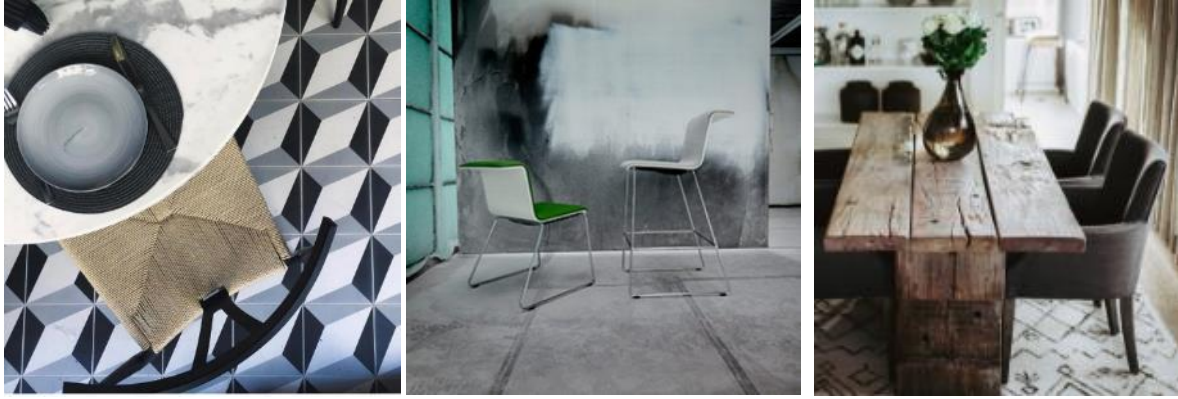
L-R mono.rocks, Bulo, Thors Design

CHOLO.design produce handmade homeware accessories and lighting in natural materials such as bamboo and hemp. The Bristol-based team is dedicated to creating products with a positive impact on consumers and the environment. Cubo by CHOLO, a humble concrete lamp turned upside down, is hand made to order & incorporates an LED bulb and bamboo fitting. Founded in 2016, Proper Copper Design has grown to become the leading online retailer for handmade-to-order copper taps, showers, handles and accessories, shipping products from their Brighton-based workshop to customers across the globe. Trained as a carpenter, director Khan Erkeksoy recognised the potential for the material's industrial yet warm aesthetic while working alongside other trades. Vincent Sheppard has been designing and manufacturing exceptionally comfortable indoor and outdoor furniture since 1992. New items on show include the Loop Collection (pictured below) and the Roy cocoon; demonstrating simplicity with a modern edge.