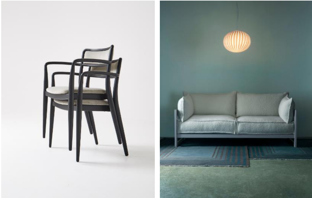
L-R Dare Studio, Established & Sons

Known for their contemporary handcrafted furniture, award-winning British design brand Dare Studio returns to 100% Design. On show will be a selection of furniture and lighting products, suitable for both luxury domestic interiors and high specification contract environments. Notable products include: the Riley Coffee Table, a modern classic, which incorporates two tables of varying heights to add flexibility in positioning and function; and the Frida Chair, a modern interpretation of the wingback chair.