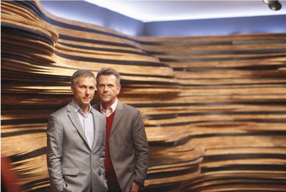
Humberto and Fernando Campana in front of their eco composite surface material

Cosentino Group, a leader in the production and distribution of quartz surfaces, natural stone and recycled surfaces will be present at 100% Design London 2010 with the project Campanas for eCosentino. The project is born from the exclusive concept of Studio Campana, which is owned by the famous Brazilian designers and brothers Humberto and Fernando Campana, who are respected worldwide for their ability to develop new art forms through the use of simple but innovative materials.