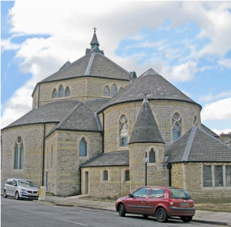
Church in Tufnell Park, London

Established in 1966 and a Royal Warrant Holder since 2004, Selectaglaze Ltd., the UK's leading secondary glazing specialist, has a wealth of experience working on buildings up to Grade 1 listed. The company offers a technical and specification advisory service to ensure the correct interface with other trades. Programmes are particularly important and proactive site surveys, linked to a modern production facility working on "Lean Principles", ensure projects are delivered on schedule and work can be phased to suit budgets. Windows arrive fully prefabricated so they can be fitted quickly and with very little disruption to the building or its occupants.