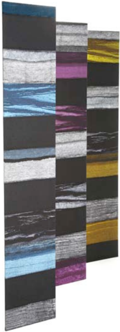
Recycled glass wool acoustic panels

Bath based Hewitt Studios LLP is an innovative multi-disciplinary design studio working in urban design, architecture and product design. They work with clients wishing to explore best contemporary practice in seeking the most sustainable project outcomes. They design high performance acoustic backing panels consisting almost entirely of glass, over 70% of which is recovered household glass and recycled glass wool. All waste is recycled. The production minimises waste and water usage as textile designs are bespoke to each individual interior and digital printing is carried out in small quantities.